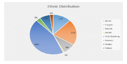
Figure-2: Ethnic background of the study participants.

Figure-1: Age distribution among OSMF patients.