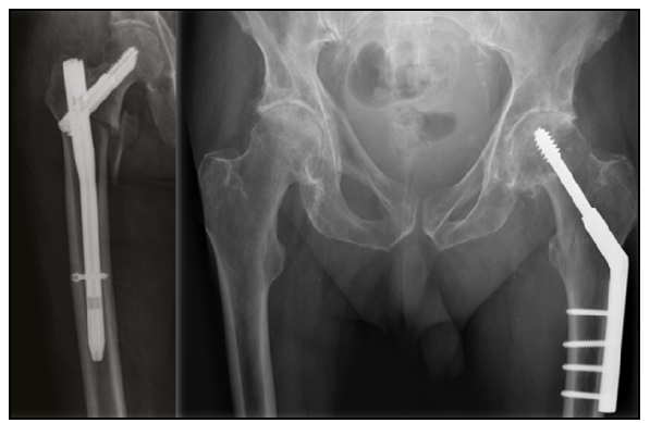
Figure-2: A. post-operative x rays showing fixation of proximal femur nailing in per trochanteric unstable fracture. B. Dynamic hip screw fixation.

All patients who had the surgery and had either PFN or DHS were included in this study. We also included patients who were readmitted for any complication requiring surgery due to implant related complications and patients who had attained mobilization and had a minimum follow up of 2 years after PFN and DHS. We excluded patients who had DHS used for intracapsular fracture fixation. Patients who died or did not achieve mobility due to other medical complications were also excluded. However, patients who could not be followed for a minimum of two years and readmission for causes other than implant related problem were also excluded.