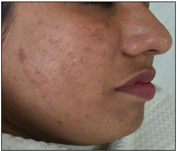
Figure-2: After completion of treatment scars downgraded to grade 2