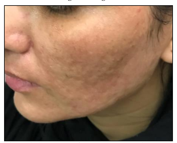
Figure-3: 26-year-old female presented with grade 3 scarring