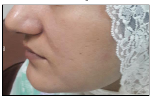
Figure-6: After completion of treatment scars downgraded to grade 1