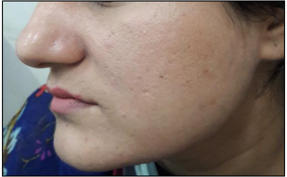
Figure-5: 23-year-old female presented with grade 2 scaring