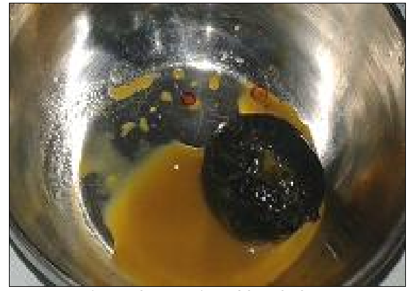
Figure-2: Fecalith of 2.5×2×2 cm