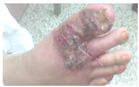
Figure-1: A non-healing lesion on right foot of a diabetic female for 2 years—An atypical presentation of cutaneous leishmaniasis.

The demographic situation of OWCL in the North West frontier Province was found as shown in Table-1.