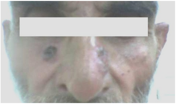
Figure-2: This presentation of OWCL could easily be mistaken as Basal Cell Carcinoma (BCC).