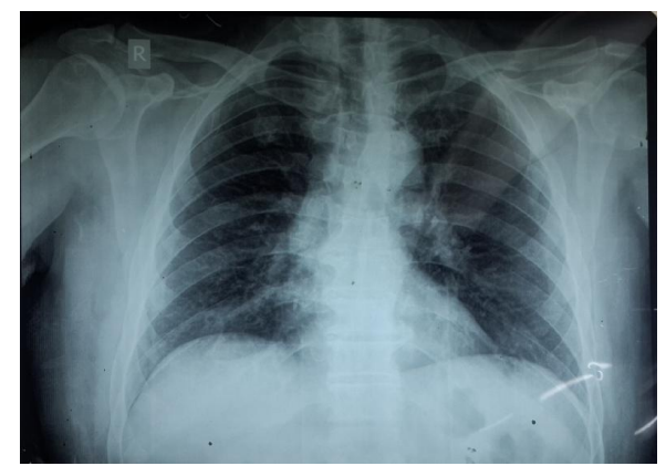
Figure-4: X-ray on follow-up