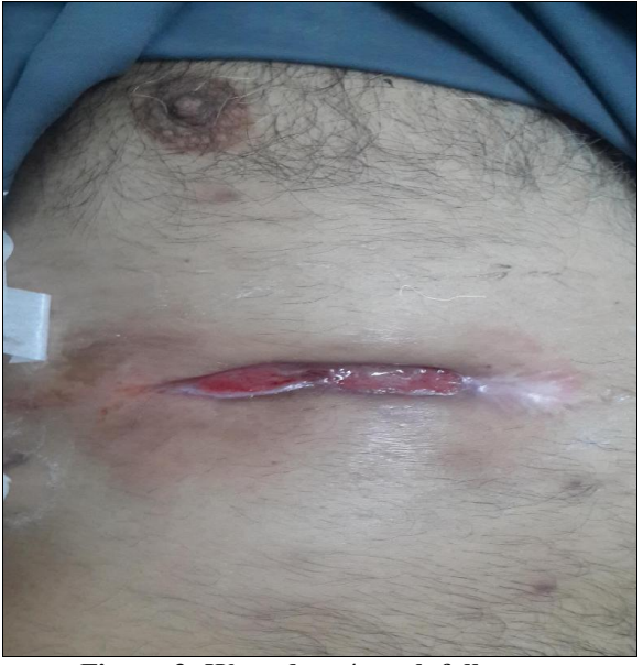
Figure-3: Wound on 4-week follow-up