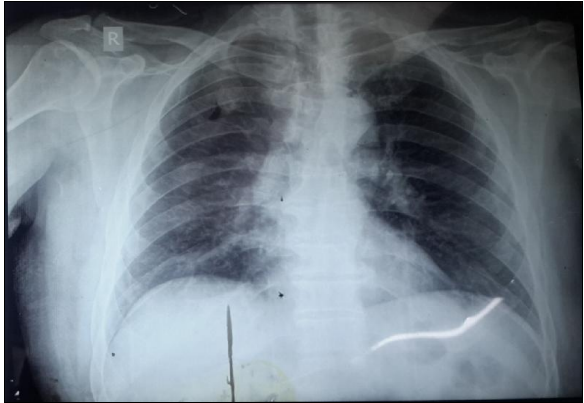
Figure-1: Initial X-ray