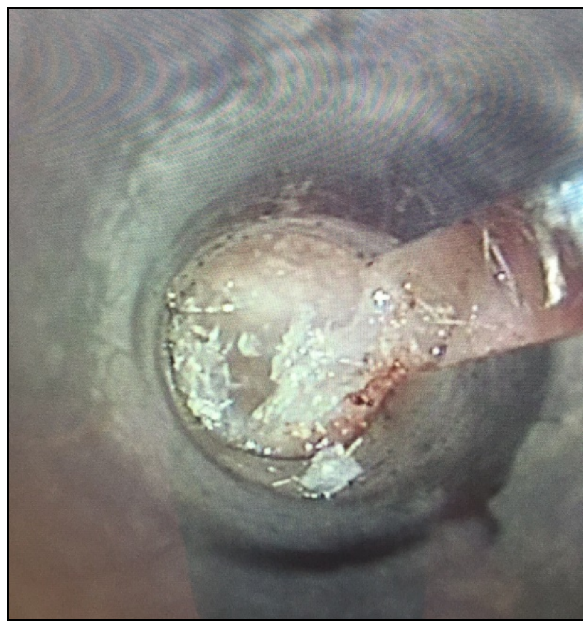
Figure-1: Illustrating the cyanacrylate adhesive in the right ear canal during surgery.

placed under general anaesthesia. Whilst under general anaesthesia acetone free nail polish remover was used to try and soften the glue but this had no effect. Before even attempting to remove the glue, time was needed to find a plane of dissection between the glue and the ear canal. Once this was decided the glue was slowly removed from the ear and then packed with Betnovate C cream. After some of the adhesive had been extracted, the ear was reassessed and it was clear the cyanoacrylate had not reached the tympanic membrane. However, the external auditory canal was inflamed and had an excoriated appearance. The patient did not experience any post-operative complications and a follow up appointment has been arranged for him in one month.