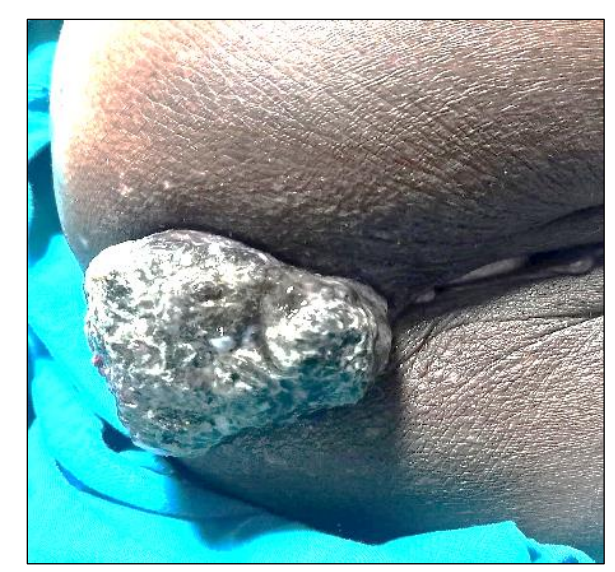
Figure-1: Anal mass as seen on clinical examination with patient lying in Sims' position

Examination of the perianal region revealed a 5×6 cm ulcero-proliferative growth present over the anal canal from eight O'clock to ten O'clock position with overlying black-coloured areas (Figure-1). The mass was foul-smelling, hard, and non-bleeding to the touch. A digital rectal examination revealed a patent anal canal with normal faecal staining. Bilateral superficial inguinal lymph nodes were palpable, firm, non-tender, non-matted, and mobile.