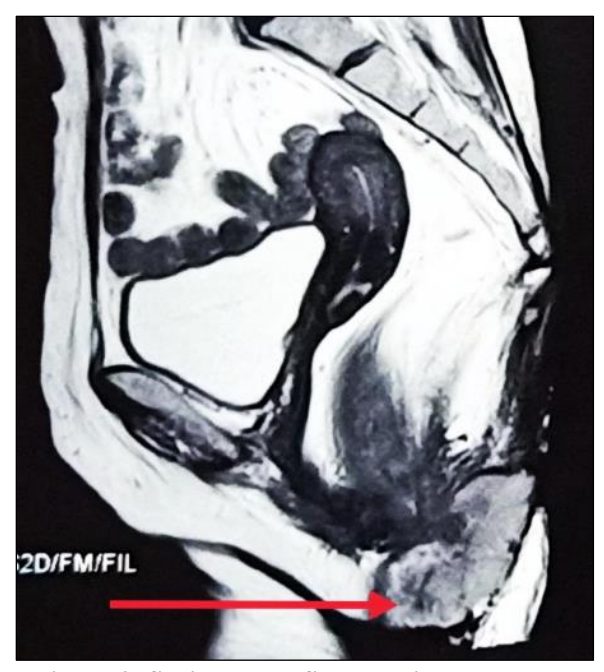
Figure-3: Sagittal MRI film showing anal mass