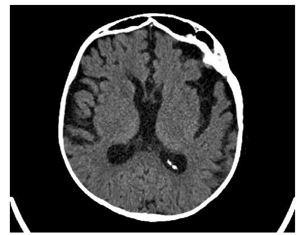
Figure-1: CT features are of generalized cortical atrophy with pan sinusitis