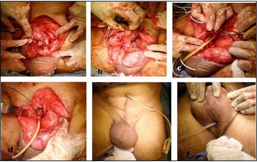
Figure-2: Operative pictures.

A): Infra-umbilical Mercedes Benz incision extending till rectus sheath and including all surrounding subcutaneous tissue. B): Exposed testes with spermatic cords; Penis degloved. C): Corpus spongiosum with urethra divided. Corpora seen to be involved by tumour. D): Crura at their origin at inferior public rami divided and ligated. Catheterized urethral stump for perineal Urethrostomy. E): Wound closed with supra-pubic catheter, and pelvic drain. F): Cutaneous perineal urethrostomy.