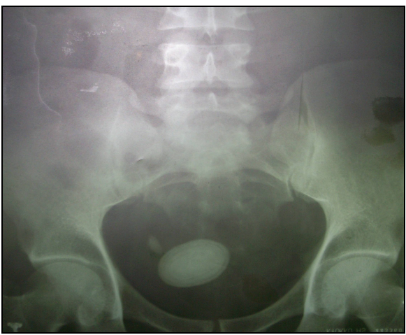
Figure-1: The size and number of stone