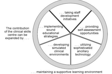
Figure-3: Adding more to the clinical skills centre pie

but should not be made an excuse as we would be denying our medical students this opportunity to become an efficient medical health professional.<sup>19</sup>