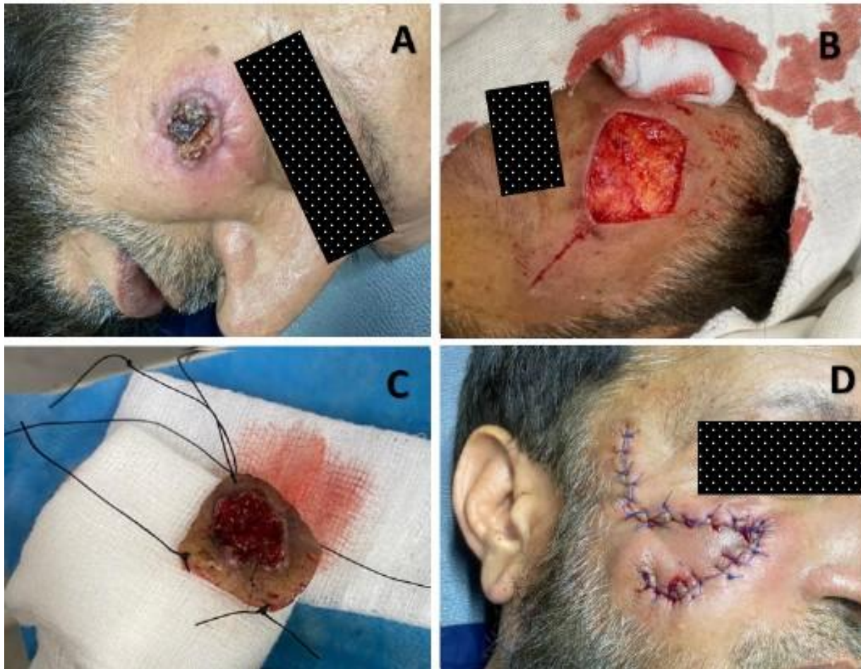
Figure-2: A. Nodulo-ulcerative BCC B. Excised under local anaesthesia C. BCC margins are tagged with threads at 12, 3, 6 and 9 'o' clock position for frozen section clearance D. Surgical defect is reconstructed after FS Histopathology report