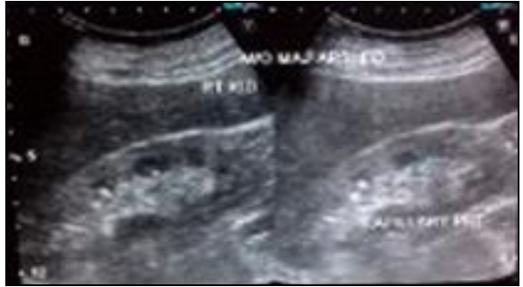
Figure-3: Both kidneys showing echogenic foci